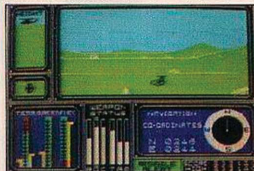
Spectrum Software — page 62.