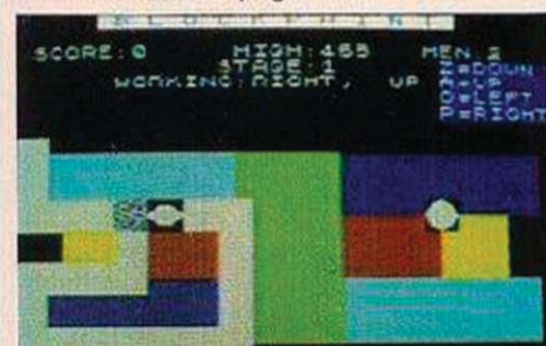
Blockpoint — page 84.