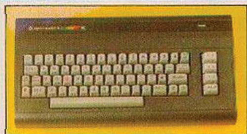
Commodore Plus 4 review — page 52.