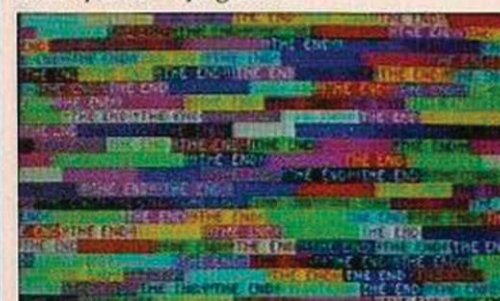
Character print: page 113.

The front cover shows a scene from Virgin Films' 1984 starring John Hurt and the late Richard Burton.