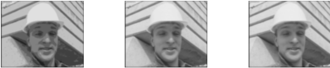
Figure 3. Representative output frame for terminating the computation at n = \{5, 2, 0\} bitplanes (shown from left to right) for the 12x12 Gaussian filtering.