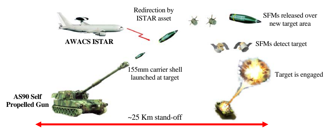
Figure 3 Ballistic SFM dispensed over a target area

The carrier shell ejects the SFM's over the target area which then find their targets using their built in sensors. Currently this ejection mechanism works on a timed fuze, constraining the SFMs to a target area that is designated at launch, however it is possible for ISTAR assets to alter this by correcting the trajectory of the munition whilst in flight, and augmenting the release pattern of the SFMs.