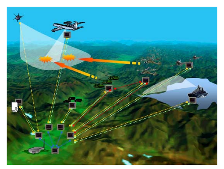
Figure 1; Complex information flow on the battlefield

Information flow in battlefield scenarios is highly important, any delay or latency leads to inaccuracy. The speed in information flow between Command Control Communications Computers Information Surveillance Targeting and Reconnaissance (C<sup>4</sup>ISTAR) assets, Permanent Joint Head Quarters (PJHQ) and effect platforms is directly related to the precision of response to threats in theatre; Figure 1 illustrates this complex flow of information.